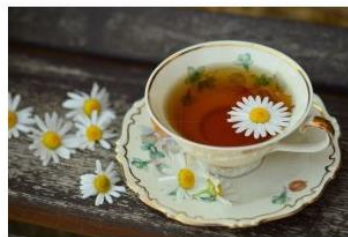
A Cup of Tea and a Kind Word