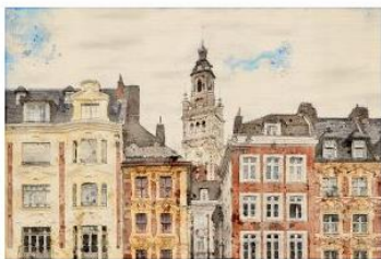
The Road to Lille

Their stories, alongside all finalists, are available to read below.