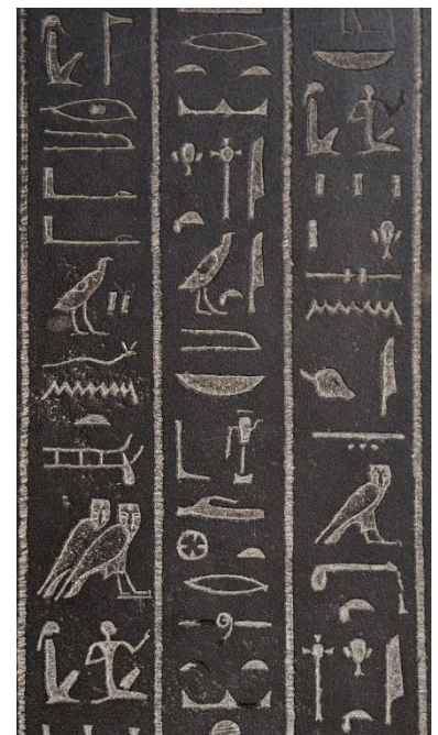
Detail from the side of the Sarcophagus of Ankhnesneferibre from the Twenty-Sixth Dynasty, about 530 BC, Thebes, at the British Museum.