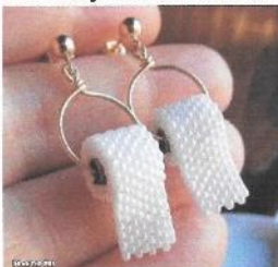
Commemorative Jewellery to always remember 2020