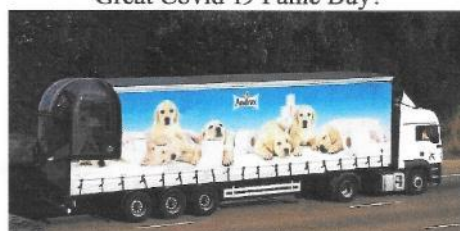
The most dangerous job going lad, Rear Gunner on an Andrex Truck.