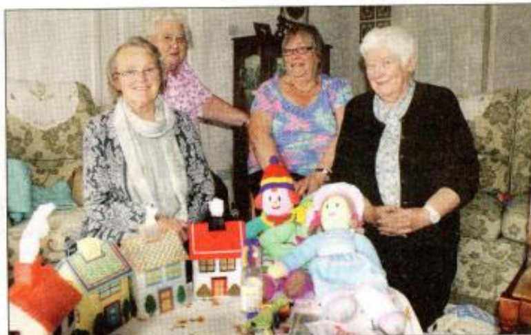
A group of the ladies with their handicrafts.

She added: "We all have our own crafts which we do at home but