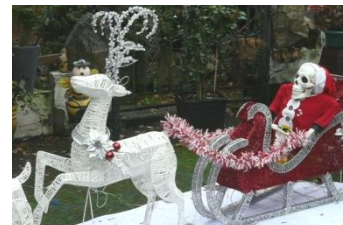
Santa spotted in Haughton Dale